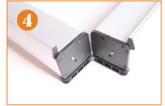
Snap in another stand into the other side