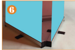
For example, use 3 stands to form a triangle environment