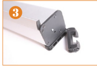
Snap in one stand into the Expandable Link