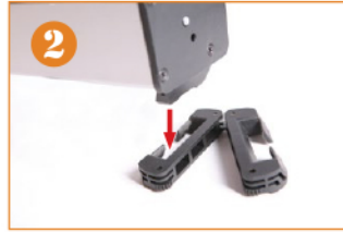
Line up the stand with the Expandable Link