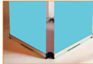
Another example, use 4 stands to create a square